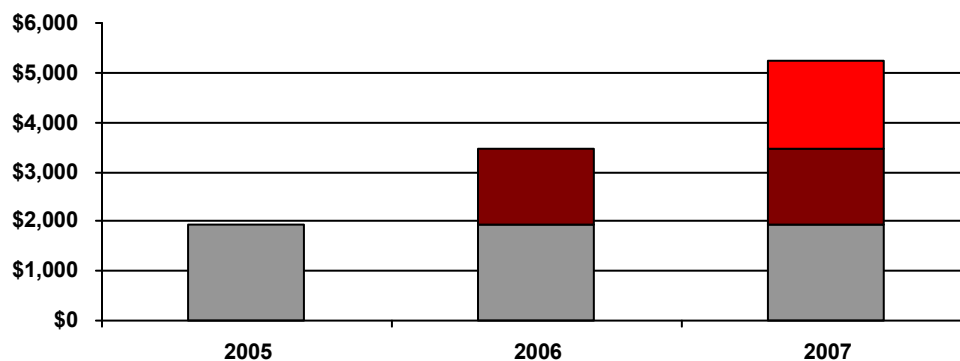
2006-2007 Debt Increases at Station Casinos ($millions)